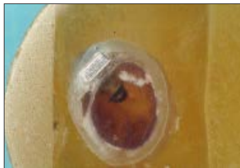
Fig 5 Embedded block.

The result of the effect tests are displayed in Table 1. A significant difference ( P = .0001 ) was found for modality (trough vs no trough) after controlling for the histologic length of the titanium plate.