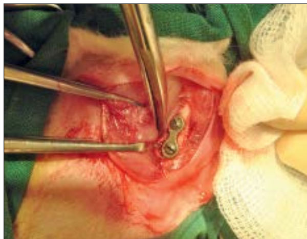
Fig 1 Subperiosteal dissection of a rabbit femur, followed by placement of an implant.

Each animal received treatment in both femora. One femur received a subperiosteal implant (fixation plate) that was anchored to the bone with fixation