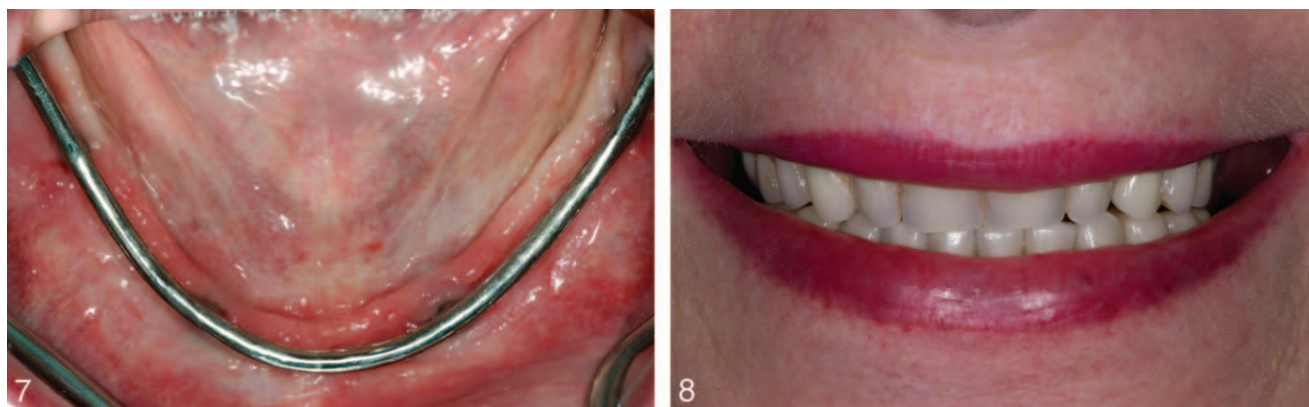
FIGURES 7 AND 8. FIGURE 7. 32-month follow-up patient's occlusal view. FIGURE 8. 32-month follow-up patient's smile.